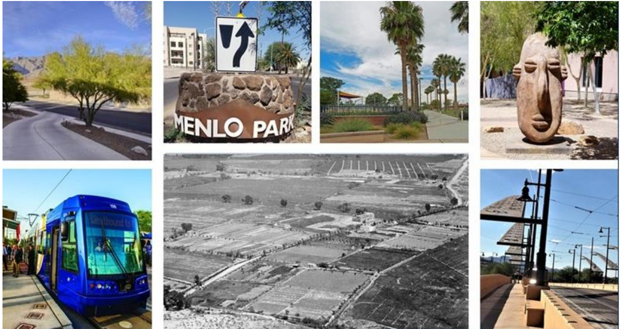
From cover of Current Conditions Report, May 2022, The Planning Center