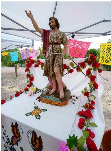
San Juan, 2023

The Yard Sale will be held on Saturday, January 27, from 8:00 AM until 2:00 PM.