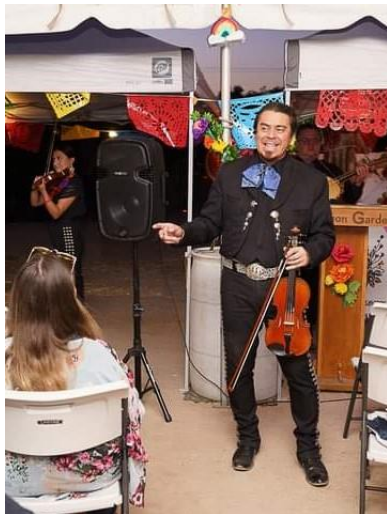
Mariachi Luz de Luna, 2023

We start the planning early in the year for the annual June Fiesta so that we will have religious and native blessings, guest speakers, entertainment, and activities for children. Announcements regarding the planning for the Fiesta will be made at the neighborhood meetings. Please consider volunteering.