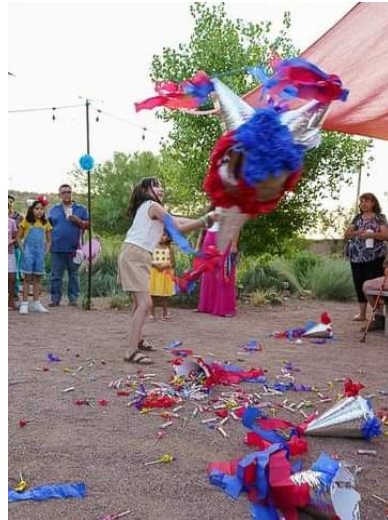
Piñata fun, 2023

Save the date: Día De San Juan will be held on June 24, 2024, at Mission Garden.